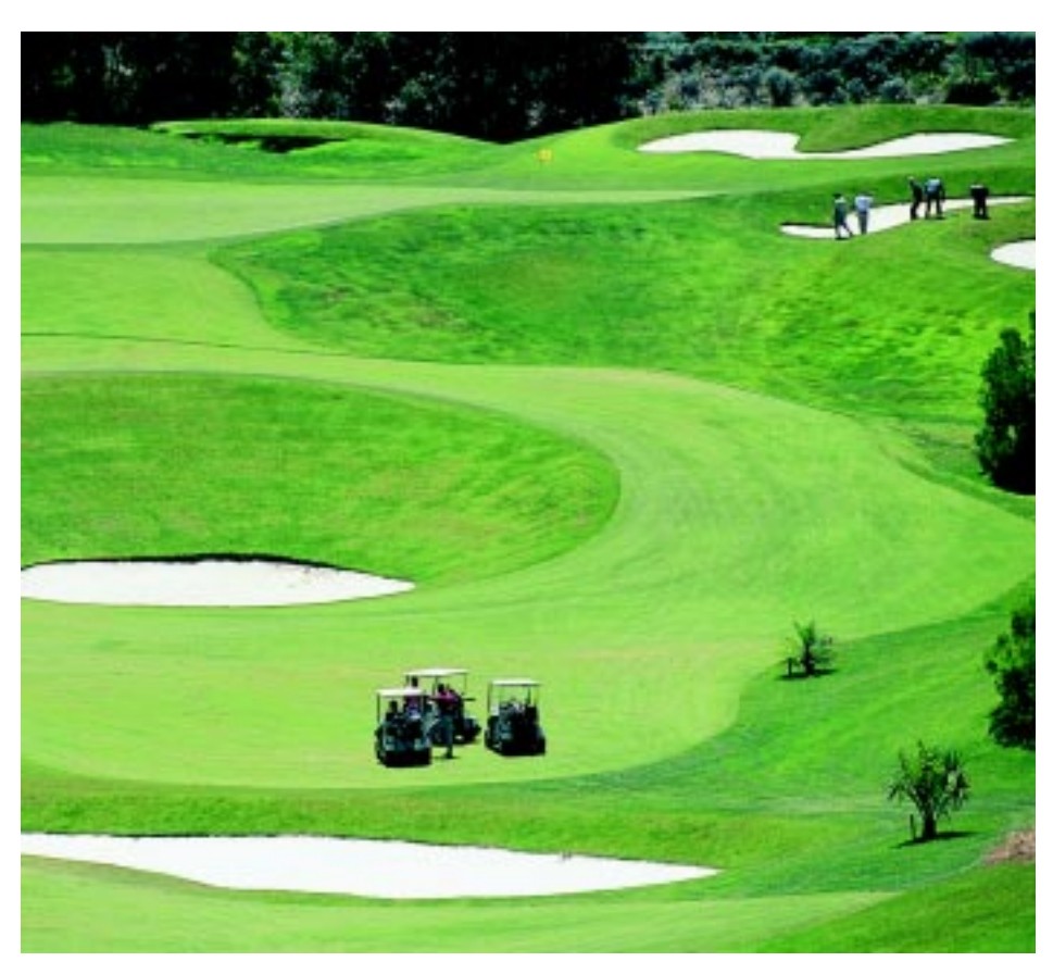
Joondalup Resort - voted Australia's top golf resort by readers of Golf Australia magazine. Joondalup took the award from another Western Australian golf resort. The Vines Resort and Country club.

When delegates aren't playing, the range and depth of supporting conference facilities is impressive. Most resorts can cater for boardroom meetings up to groups requiring large indoor facilities or outside marquees. The flexibility can be useful for presentations other than the traditional end of day prize-giving cer-